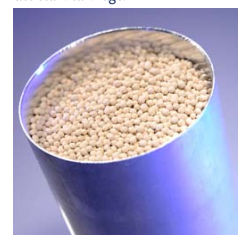
Unique patented nano desiccant cartridge.

Desiccant air dryers are used for high purity applications where pressure dewpoints of -70,-40 and -20°C are required according to ISO8573.1 humidity classes 1, 2 and 3 respectively.