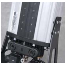
Atmospheric exhaust silencer.