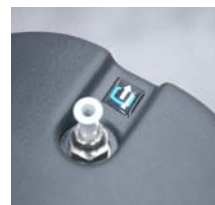
Quick release outlet connector.