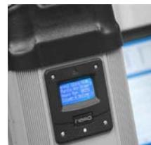
PLC controller with clear text display.