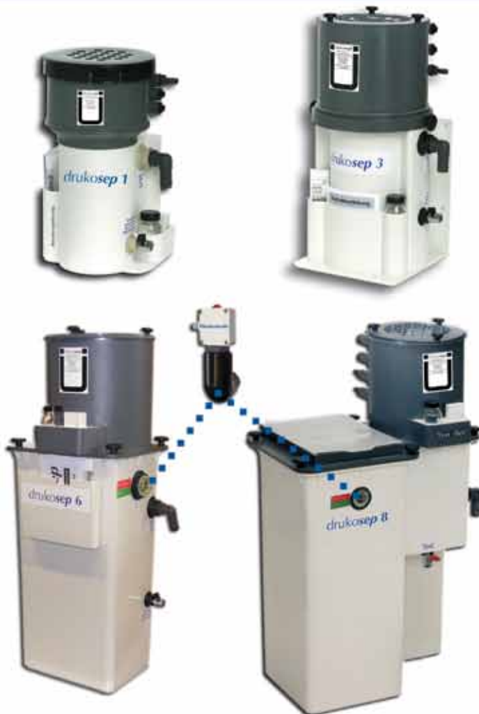
Flow diagram drukosep